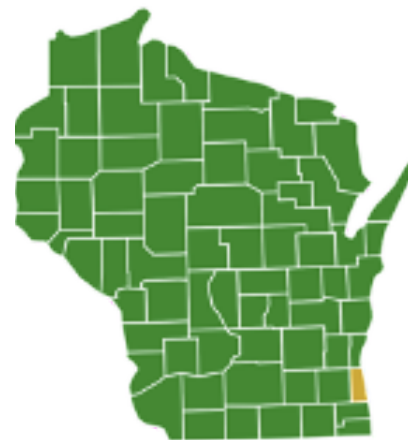
Sanders: Green, Clinton: Yellow

We know you love Bernie's superior policies on climate, health care, etc., because he won all but one county in 2016.